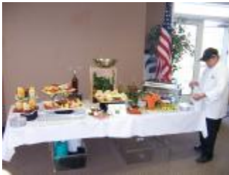
Staley Farms Golf Club