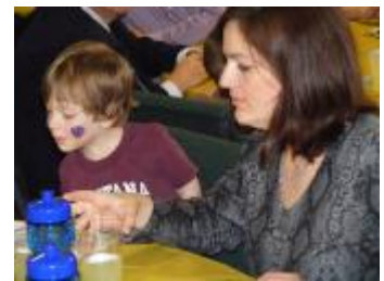
Bring Your Child to Work / Lunch Day!