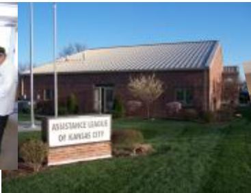
Taste of the Northland!