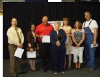
Congratulations Small Business of the Year: Majestic Resource!